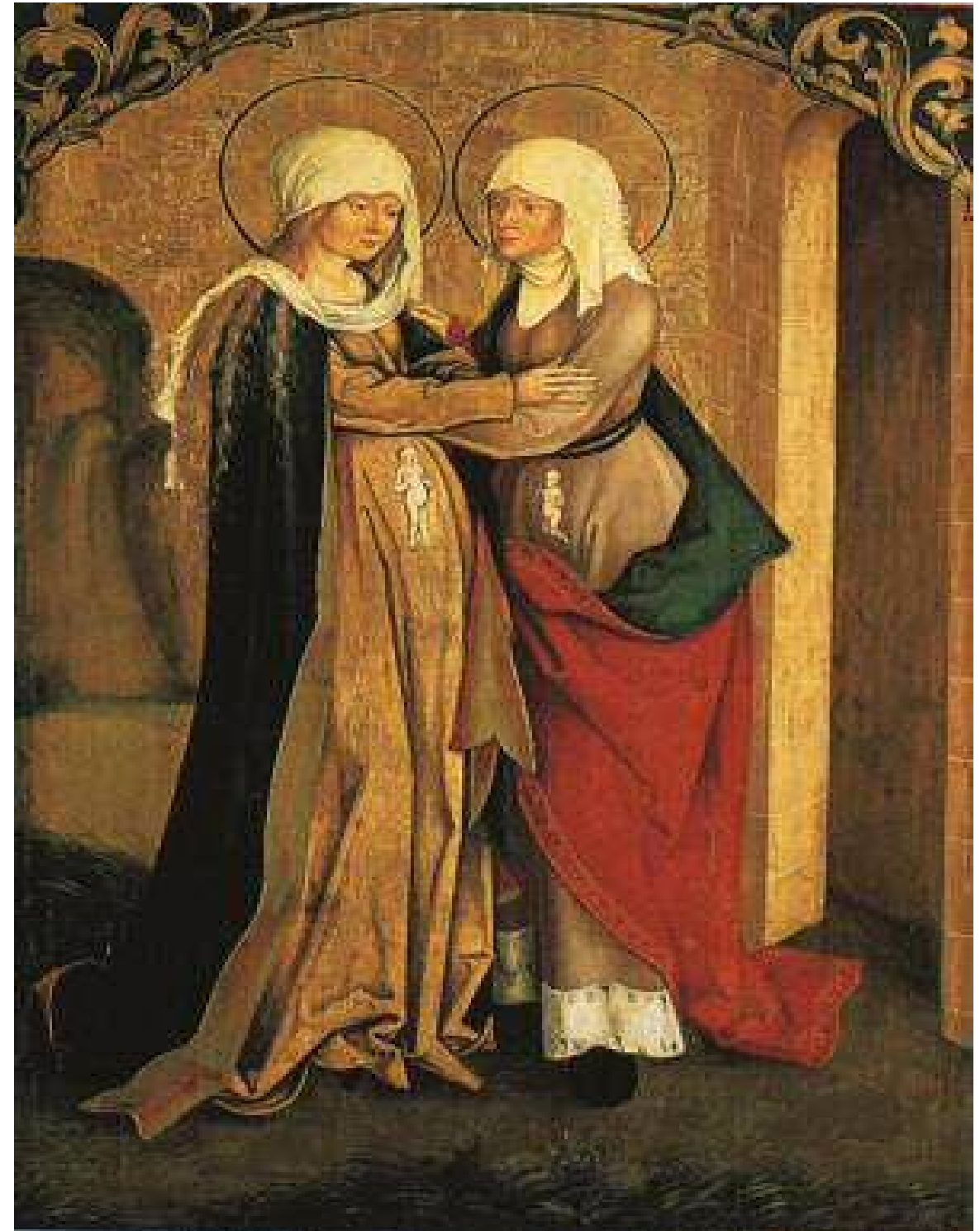
The Virgin Mary visits her cousin, Elizabeth.

(Maronite Prayer of the Faithful, Volume 1)