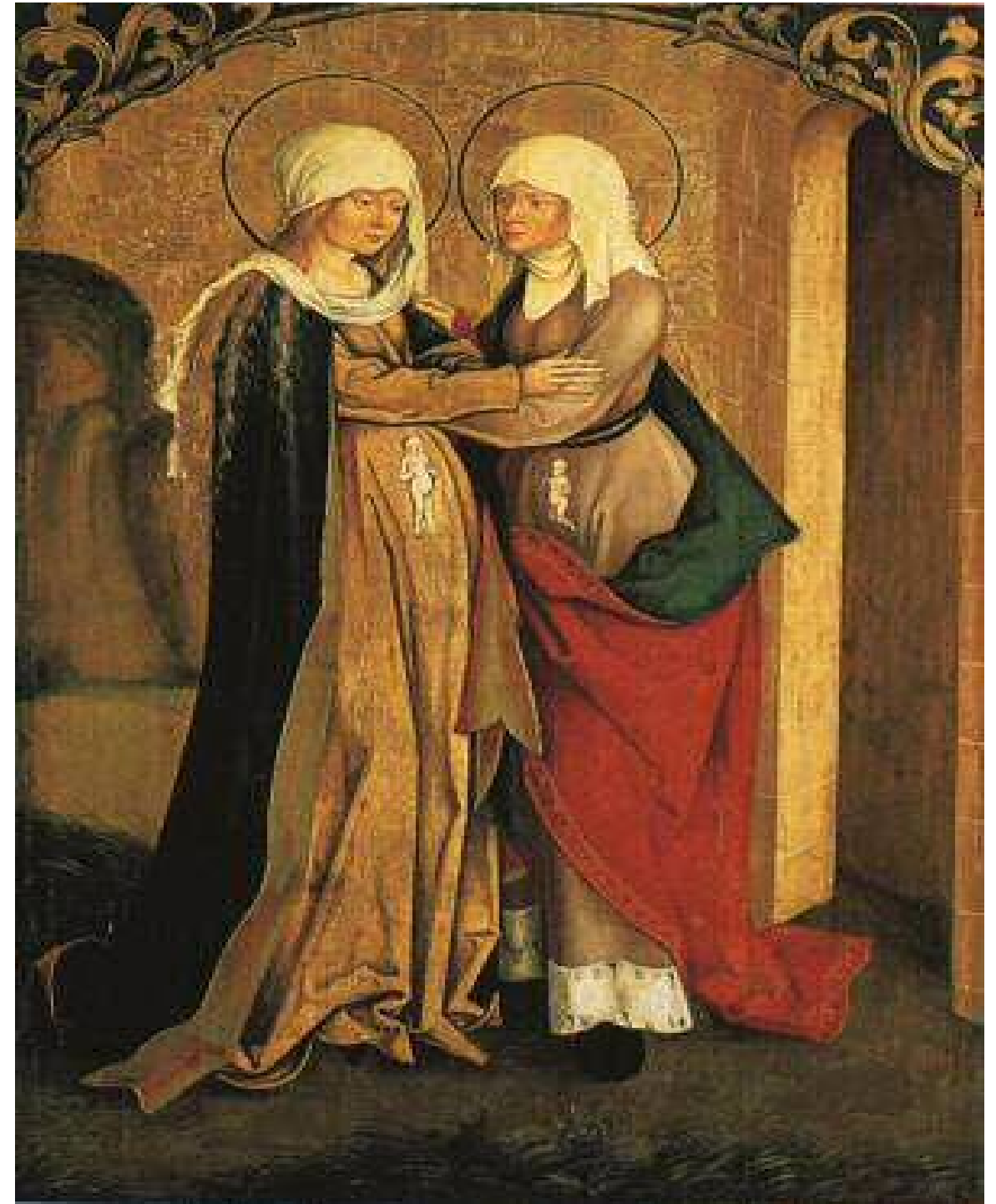
The Virgin Mary visits her cousin, Elizabeth.

(Maronite Prayer of the Faithful, Volume 1)