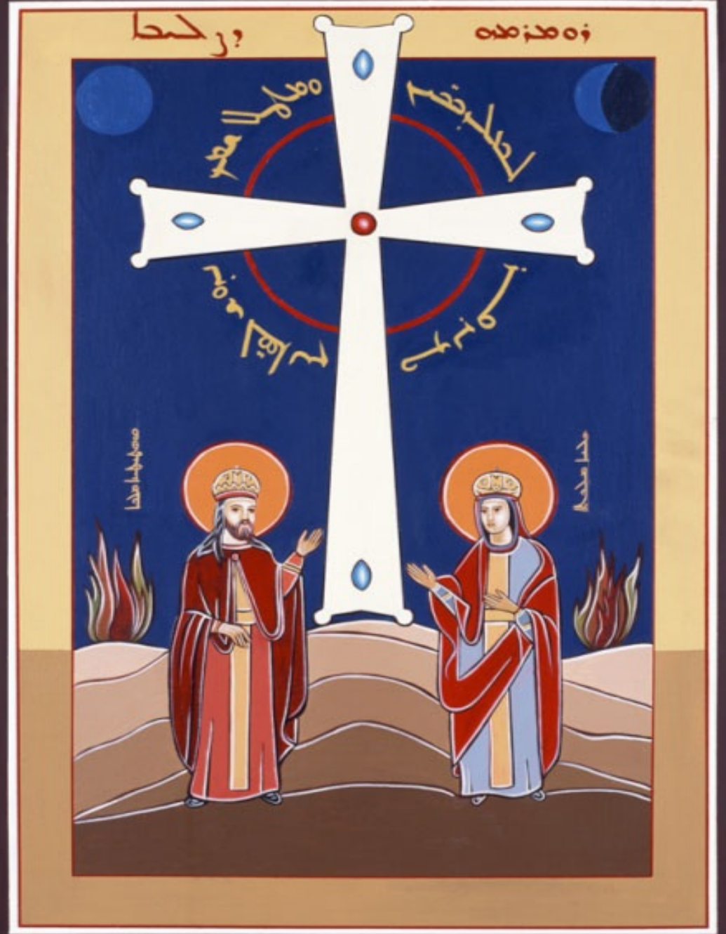
The Exaltation of the Holy Cross (by Fr. Abdo Badawi - USEEK)

Crowning (Marriage) Please contact the pastor at least Six Months prior to the wedding. Pre-marriage formation classes are required for both, bridegroom and bride. In case of a prior marriage, no wedding date, (not even tentatively) can be set until the Eparchial Marriage Tribunal makes its final decision.